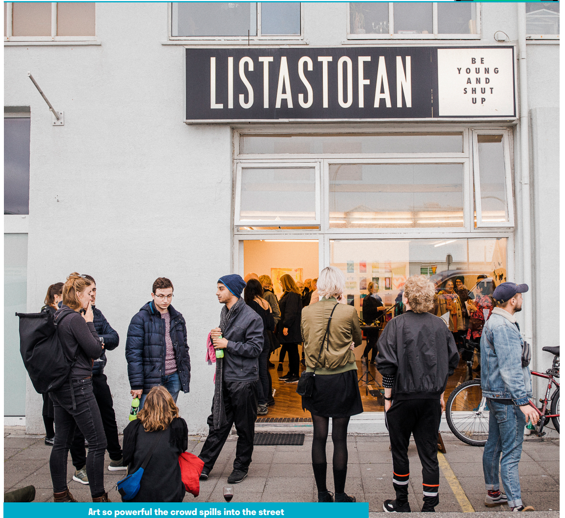
Art so powerful the crowd spills into the street